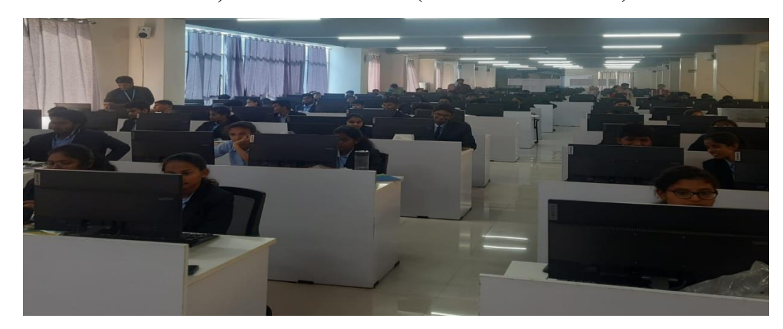
06/03/2024, 9:20AM-11:50 AM-(AI&ML, EEE Room No.7113)