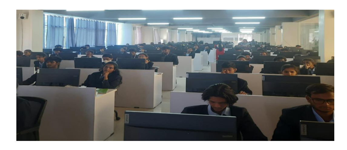
06/03/2024, 1:20PM-3:50PM (CSE(AI&ML)- A& B IT- C: Room No.7113)