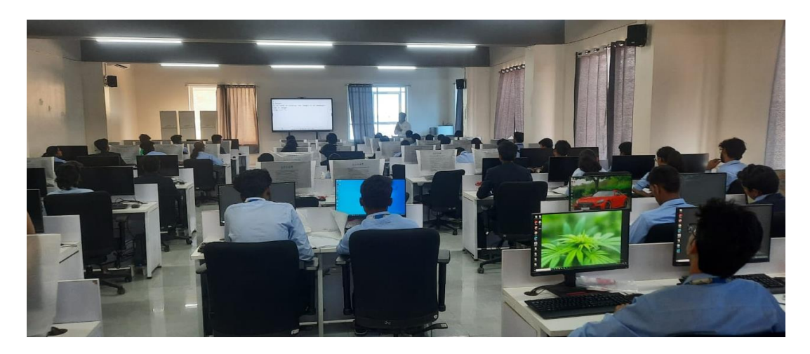
06/03/2024, 9:20AM-11:50 AM-(CSG: Room No.7310)