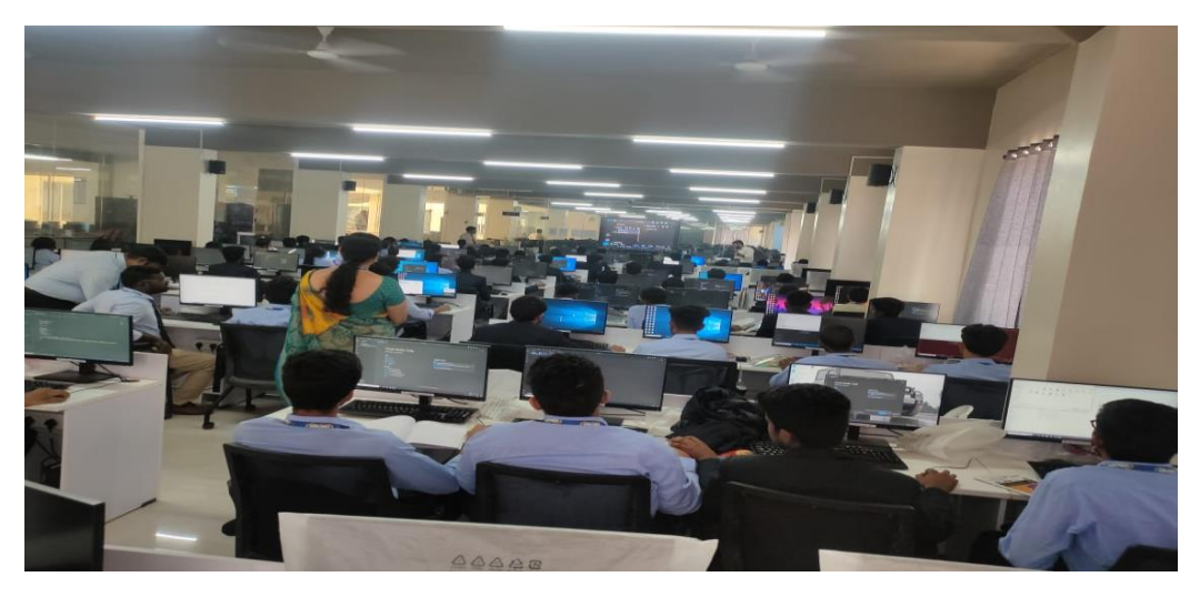
06/03/2024, 1:20PM-3:50PM ( IT-B& C: Room No.7112)