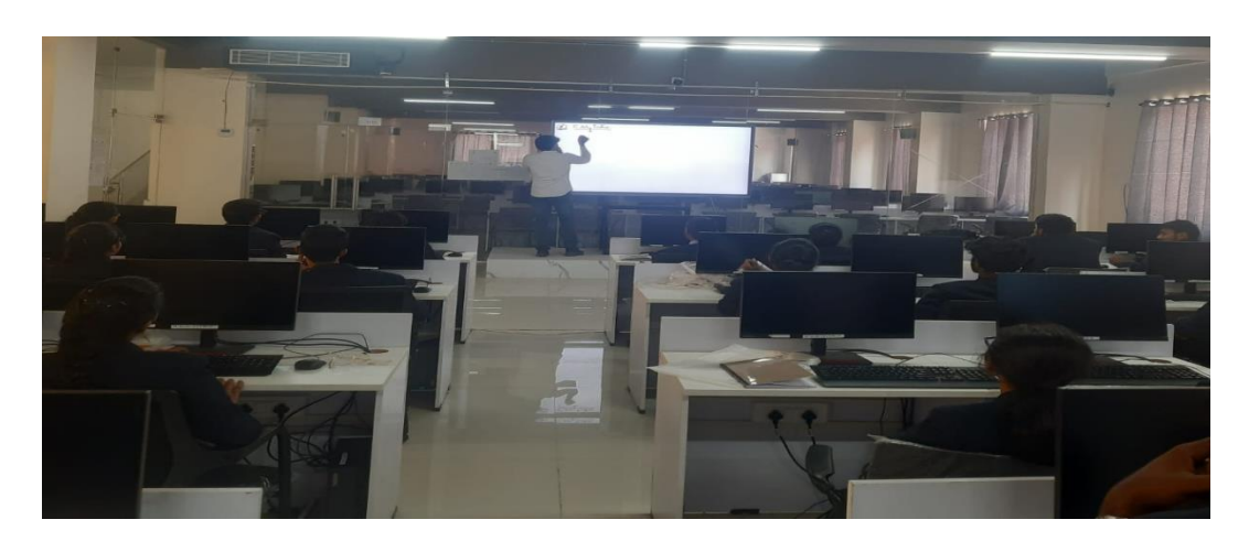
06/03/2024, 1: 20PM-3:50PM (CSE(AI&ML)-B ,C & IT-C: Room No.7310)